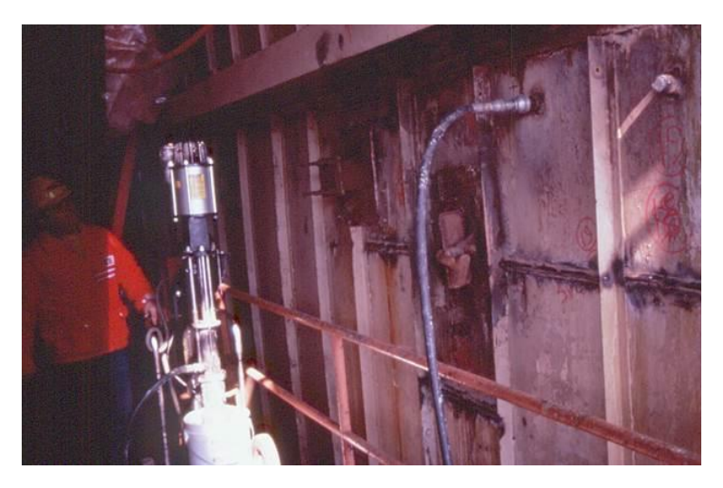
Figure 2 shows how the repair materials can be pumped in from the outside to fill the hot spot and cool a particular area.

By Steve Chernack, Morgan Advanced Materials