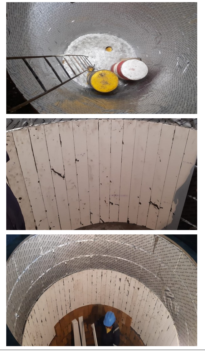
Design, engineering, supply and application of proposed system for optimal performance